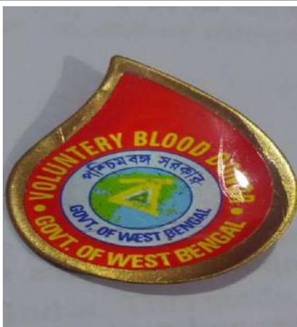
Felicitations badge, given to the participant donors