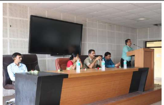
Inaugural Session, Seminar Hall, Ground Floor of Academic Building, RKMGEC