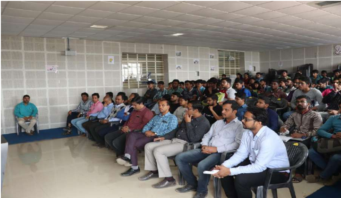
Audience in the inaugural session of BDC. In the front row HoDs & other faculties of RKMGEC are seen present

Keeping the BDC in mind, the NSS Unit organised a healthy and balanced food for the active participants and the doctors and medical staffs, which are as follows –