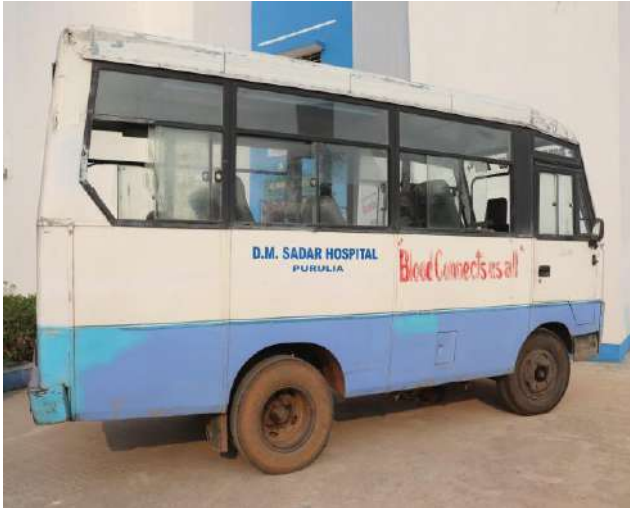
The Bus, carrying Purulia Blood Bank Unit to RKMGEC