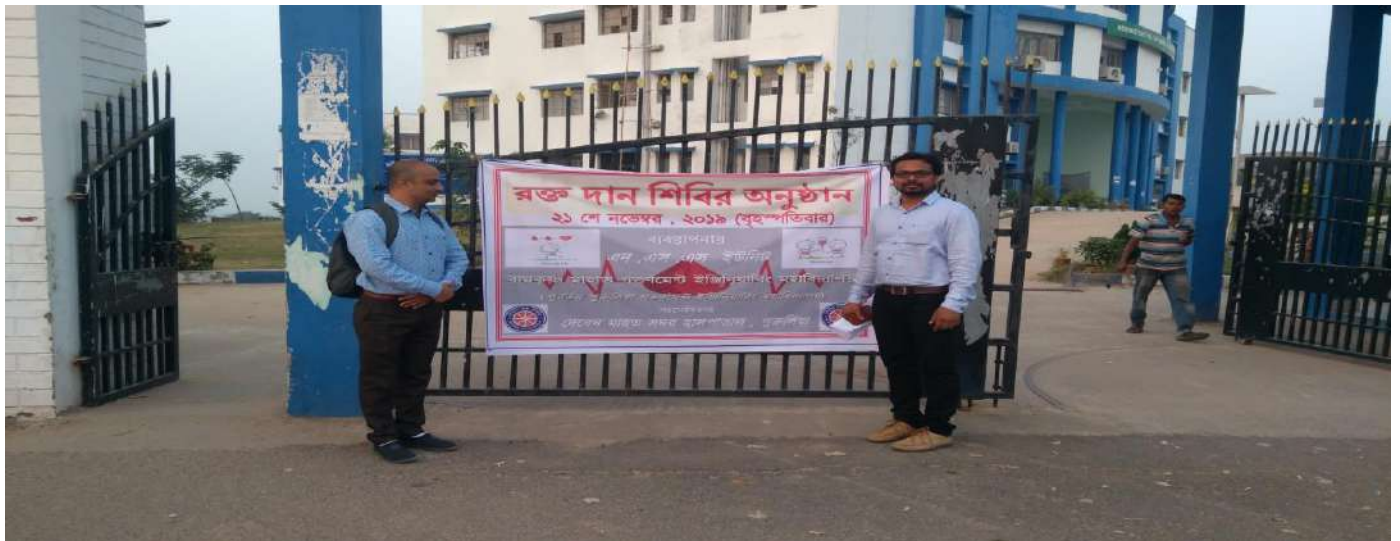
BDC awareness banner at the main entrance of RKMGEC