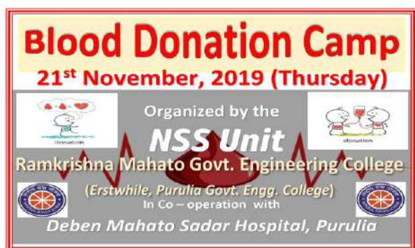
The Banner of the Blood Donation Camp in English

The NSS Unit RKMGECE started its maiden activity by organizing a Blood Donation Camp ( henceforth BDC) on 21 st November, 2019, with the help of the member students of the NSS Unit and in collaboration with the Doctors of the Deben Mahato Sadar Hospital, Purulia, second to the BDC organized independently by the dept. of EE, earlier in the month of July – August 2019.