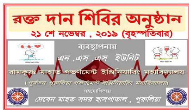
The Banner of the Blood Donation Camp in Bengali