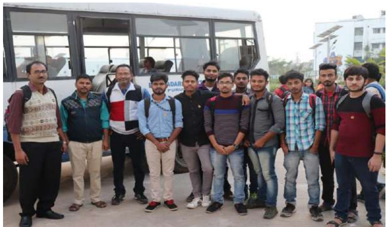
Group Photo of Students with the Program Officer, NSS Unit, RKMGEC