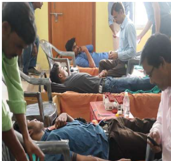
The BDC Site, Seminar Hall, First Floor, Academic Building, RKMGEC