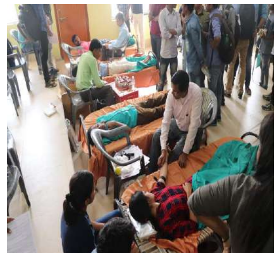
The BDC Site, Seminar Hall, First Floor, Academic Building, RKMGEC